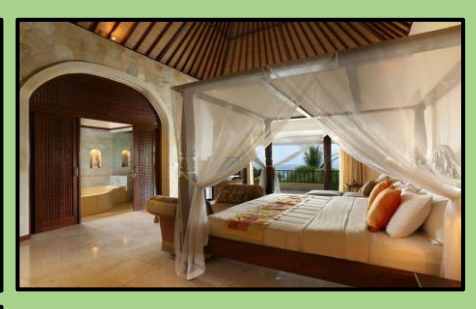
This special package includes: