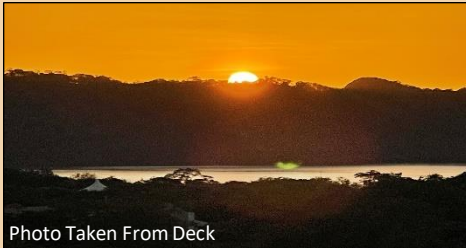
Photo Taken From Deck